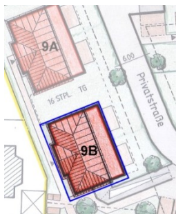
Grundriss-Skizze Wohnung 10, Penthouse ~ 165 m 2